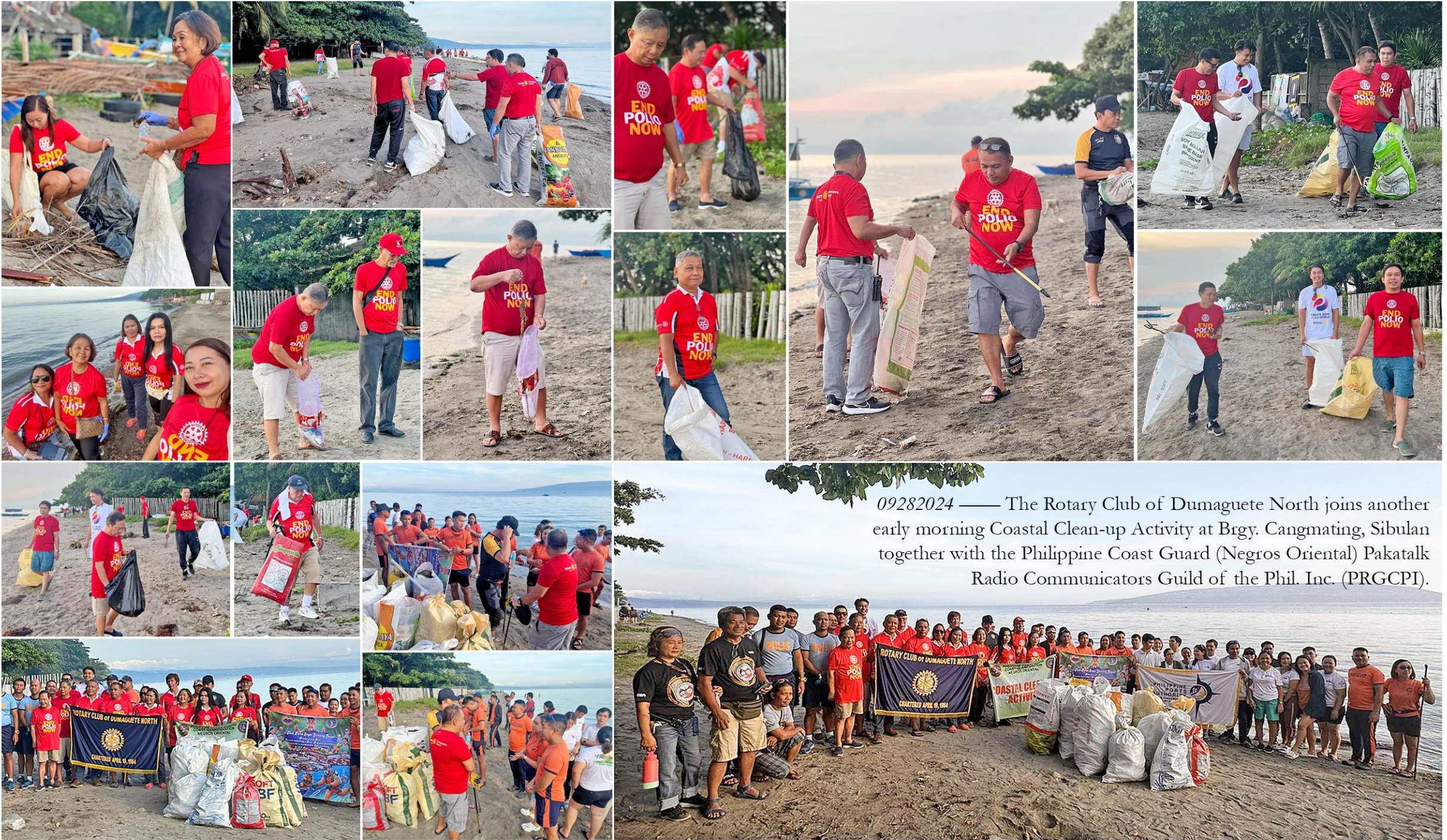
09282024 — The Rotary Club of Dumaguete North joins another early morning Coastal Clean-up Activity at Brgy. Cangmating, Sibulan together with the Philippine Coast Guard (Negros Oriental) Pakataalk Radio Communicators Guild of the Phil. Inc. (PRGCPI).